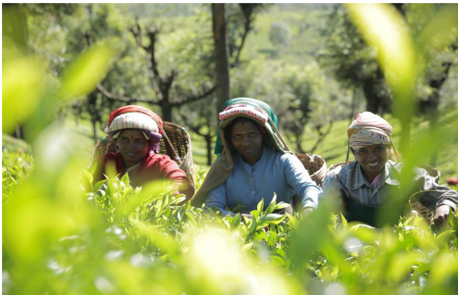
United Nilgiri Tea Estates (UNITEA) in Tamil Nadu, India provides vital support to their workers.